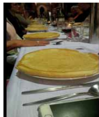
In true Mediaeval style, we had trenchers for plates, but no forks