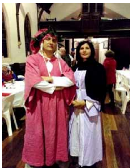
Dante with Beatrice?