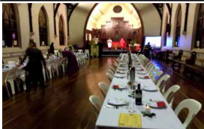
The beautiful Heritage Hall is ready for the celebration