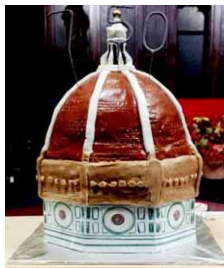
The birthday cake looked great and tasted even better