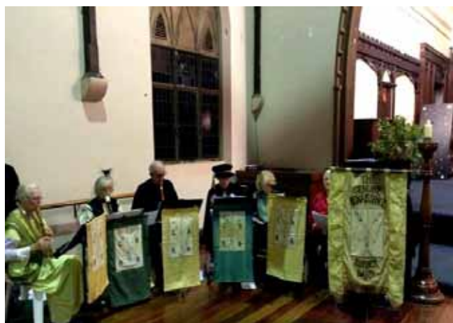
The Genuine Renaissance Rubber Band played true Mediaeval music