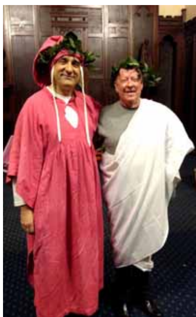
Dante came with Virgil to guide us