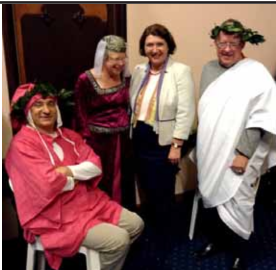
The Poet, the President, the Councillor and the Guide